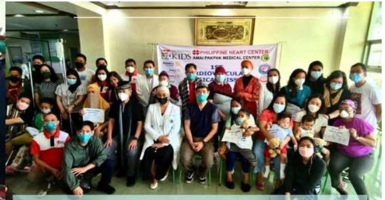
The First Open Heart Surgery in Muslim Mindanao Amai Pakpak Medical Center, Marawi City, Lanao Del Sur on November 21-24, 2021