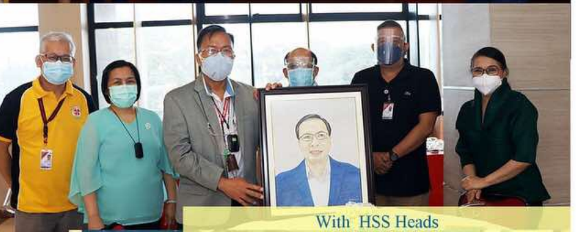
With HSS Heads