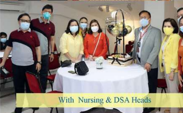
With Nursing & DSA Heads