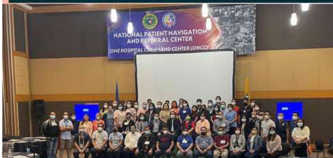
One Hospital Command Center Meeting, PICC