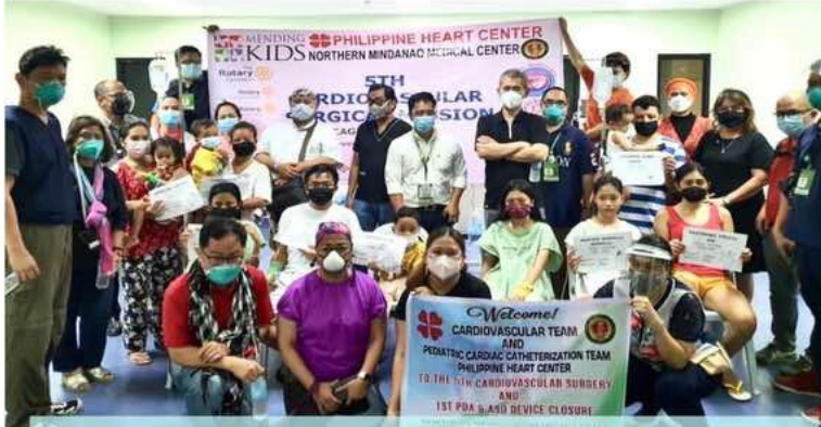
First Congenital Heart Disease Device Closures in the new Cathlab of the Northern Mindanao Medical Center, Cagayan de Oro in Tandem with the PHC Mission Team, Nov. 22-25, 2021. There were 8 PDA device closures and 1 ASD device closure done